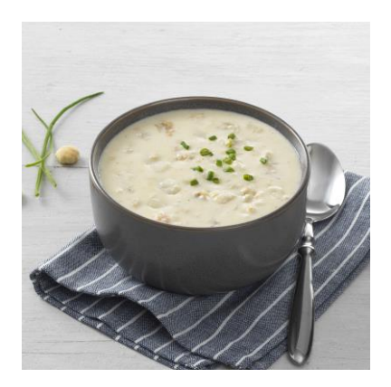
Contains Fish, Milk, Shellfish.

Haddock, shrimp, scallops, clams, tender potatoes and minced carrots in a roux-thickened seafood stock with light cream and a touch of sea salt.